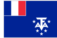
French Southern Territories