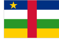
Central African Republic