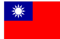
Taiwan (Republic of China)