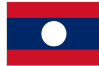
Laos (Lao People's Democratic Republic)