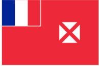
Wallis and Futuna Islands