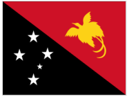
Papua New Guinea