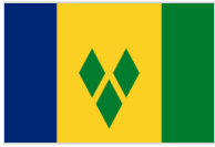
Saint Vincent and the Grenadines