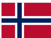
Svalbard and Jan Mayen Islands