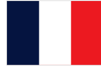
Saint Pierre and Miquelon