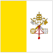
Holy See (Vatican City State)