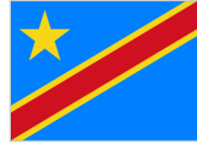
Congo, the Democratic Republic of the