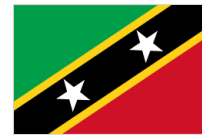
Saint Kitts and Nevis